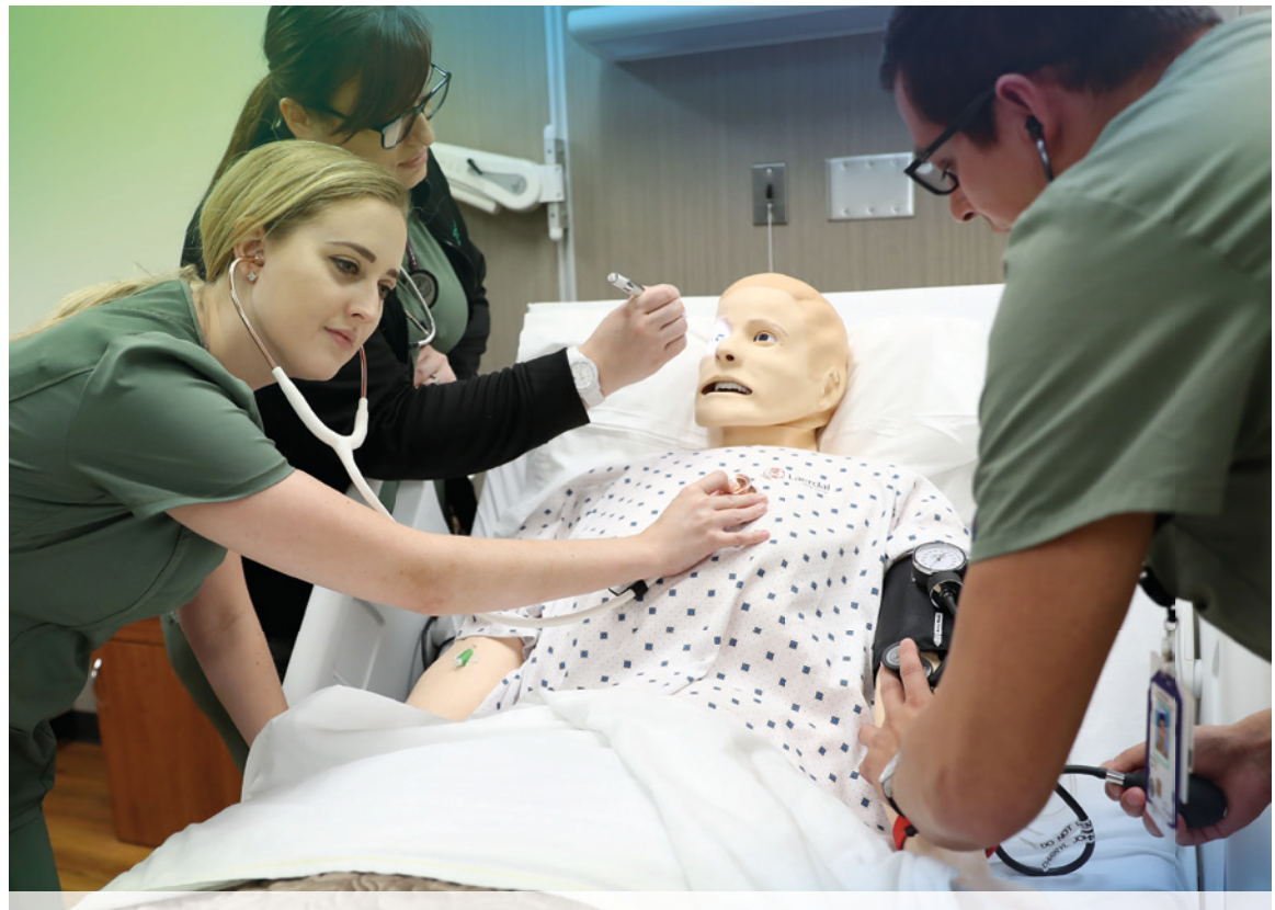
Hands-on learning in WCC's Nursing Center of Excellence simulation lab.

• Engage strategically with local communities served by the college, particularly to address areas of access such as the digital divide.