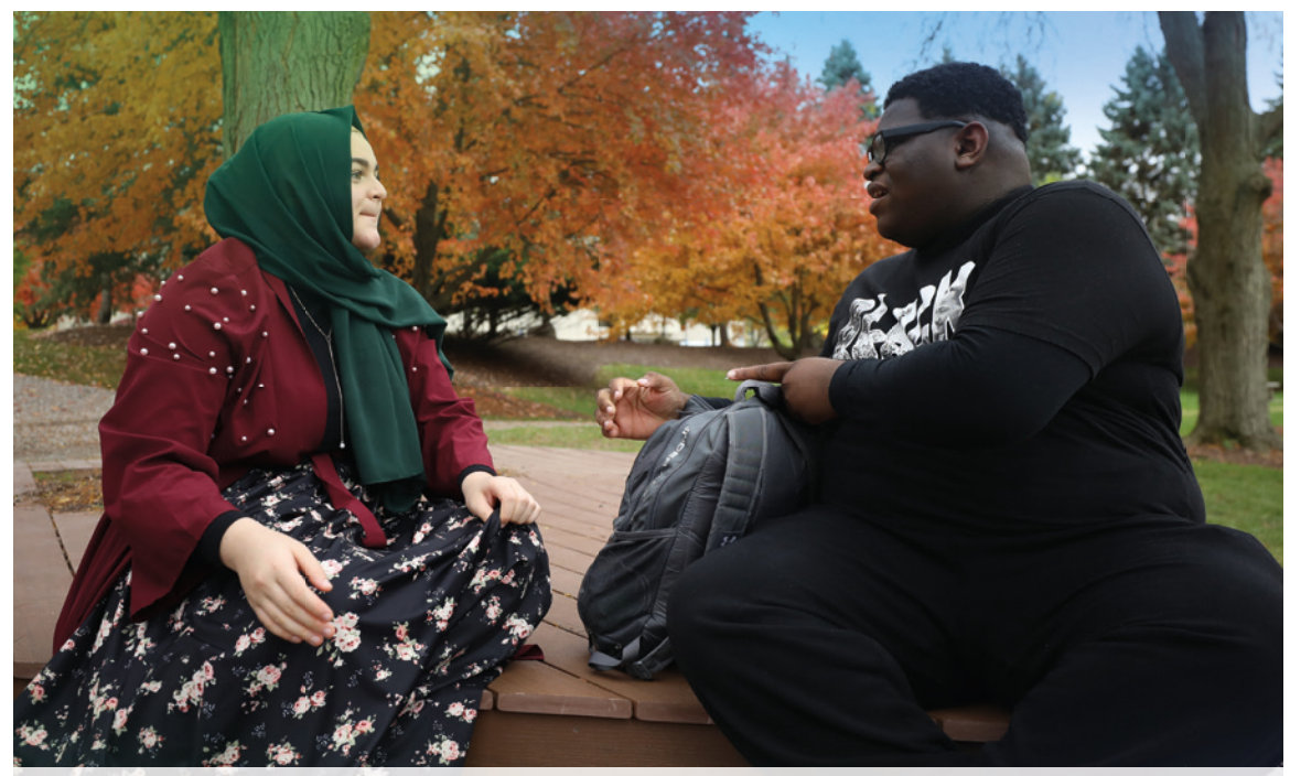
WCC students in discussion near the campus green.

Opposite Page: A WCC student working on an IT project.